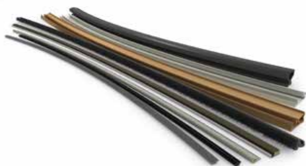
Schlegel Sealing Systems