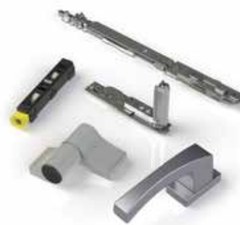
Giesse Hardware Systems